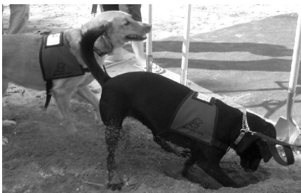
Photo (left): The canine partners were happy to take part in the groundbreaking ceremony, however as you can see they had no need for shovels!